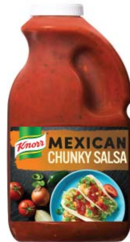
Knorr Mexicasa Mild Chunky Salsa 1.95kg (61025470)