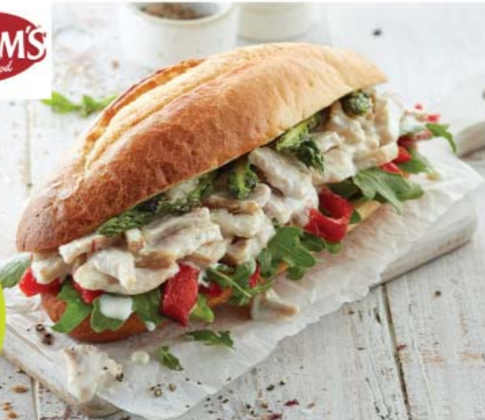
Ingham's Gluten Free Diced Roast Chicken Meat Free Flow 1kg (009810)