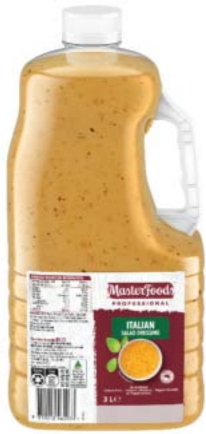
Masterfoods Gluten Free Italian Dressing 3lt (157941)