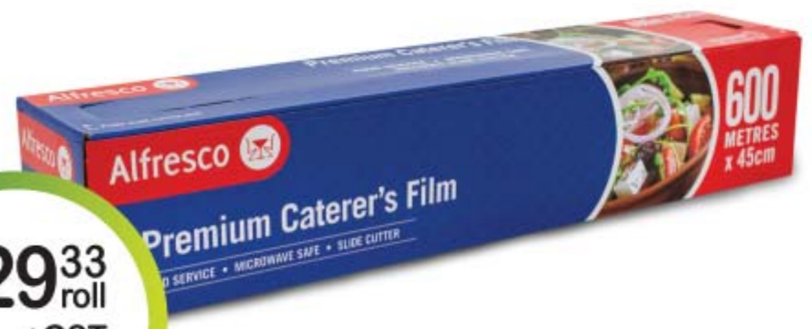
Alfresco Premium Caterer's Film (600m x 45cm) (ACF45)