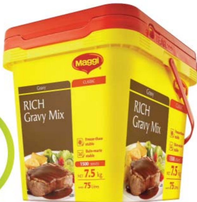
Maggi Rich Gravy Mix 7.5kg (12169542)