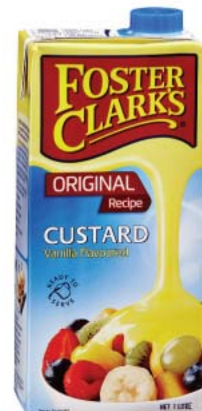
Foster Clark's UHT Liquid Custard - Vanilla 1L (835600)