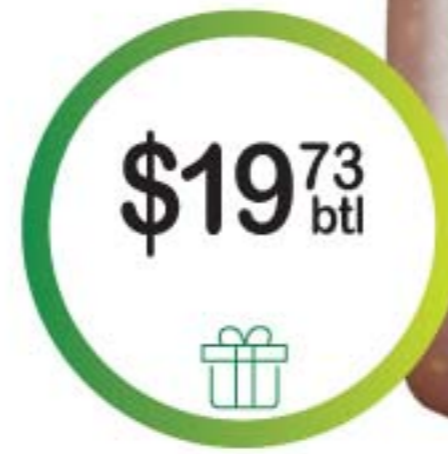
A&T Trading Sweet Chilli Sauce 1L (SAUCE07)