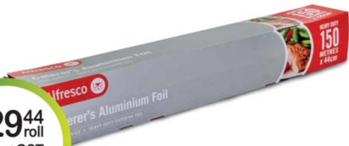
Alfresco Caterer's Heavy Duty Aluminium Foil (150m x 44cm) (AFRHD44)