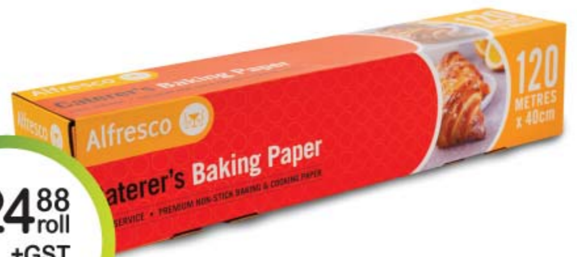
Alfresco Caterer's Baking Paper (120m x 40cm) (ABP40)