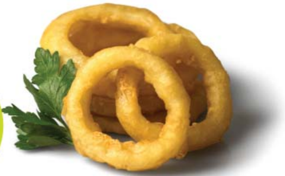
A&T Trading Beer Battered Onion Rings 1kg (BBO2)