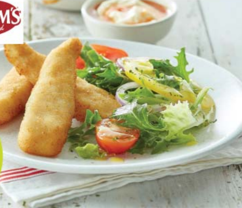
Ingham's Crumbed Chicken Tenders 1kg (5563600)