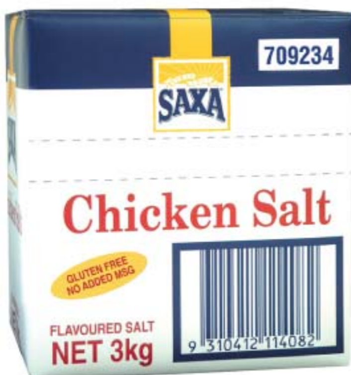
Saxa Gluten Free Chicken Salt 3kg (709234)