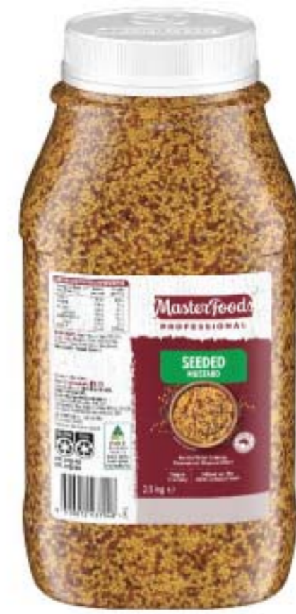
Masterfoods Seeded Mustard 2.5kg (157554)