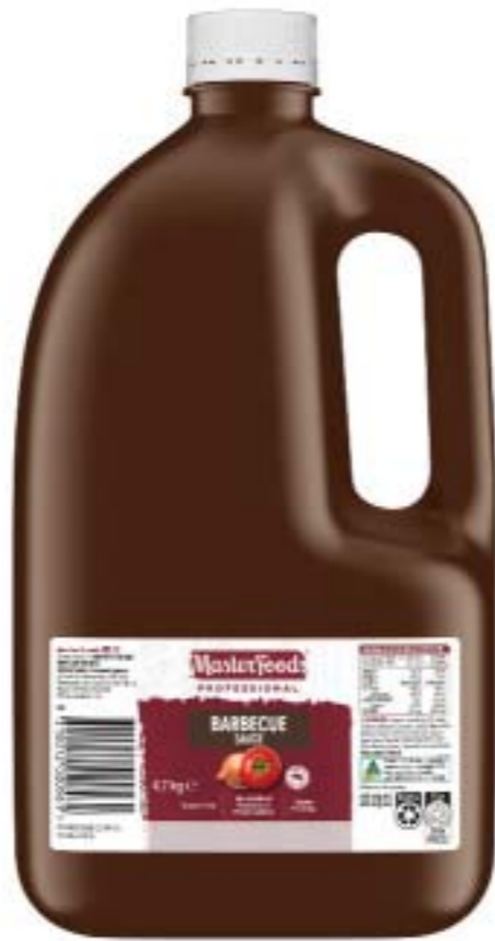
Masterfoods Barbecue Sauce 4.7kg (157112)