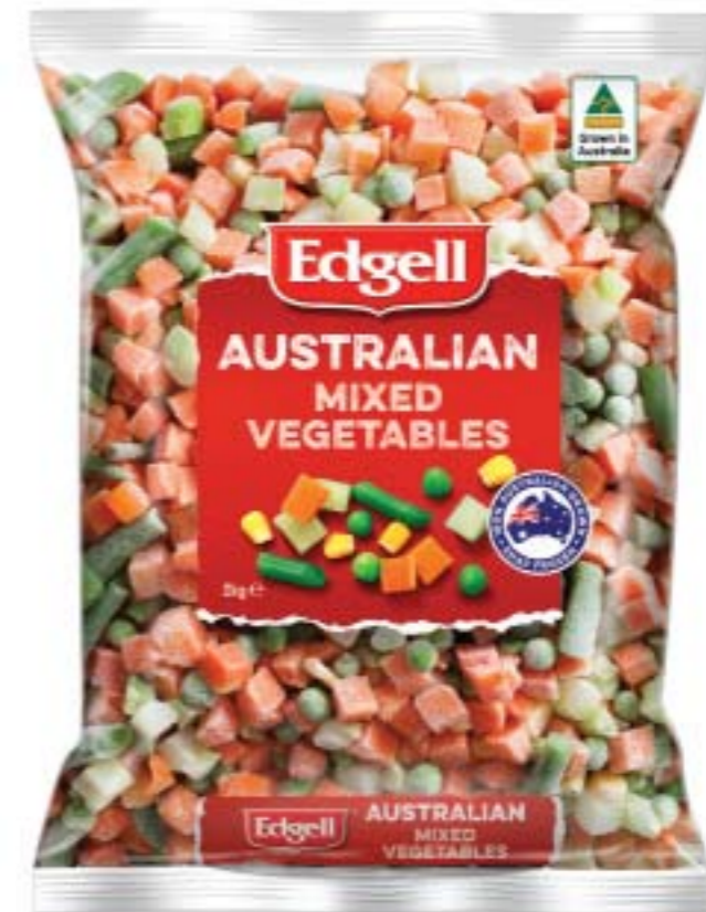
Edgell Mixed Vegetables 2kg (40259)