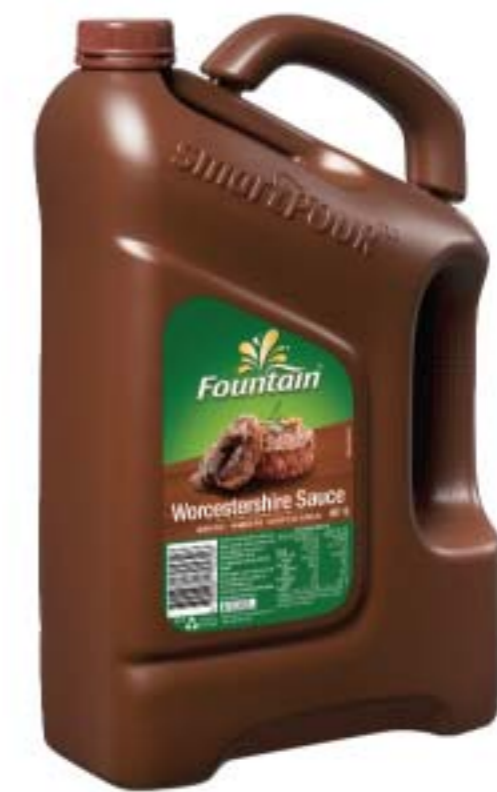
Fountain Gluten Free Worcestershire Sauce 4L (217529)