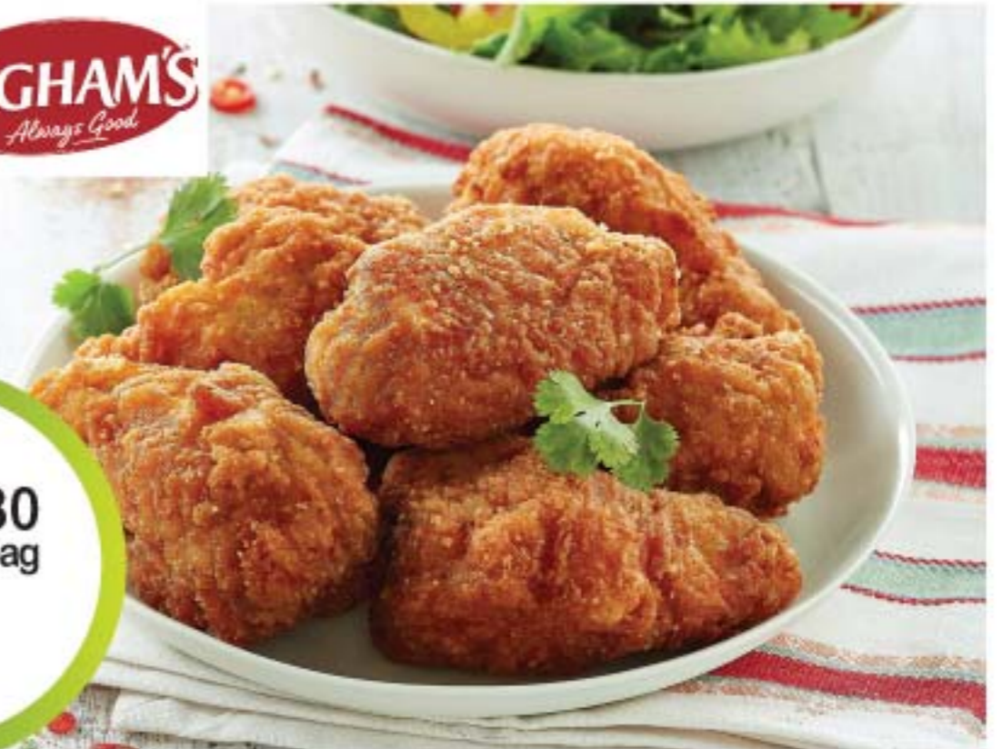
Ingham's Devil Wing Dings 1kg (0020540)